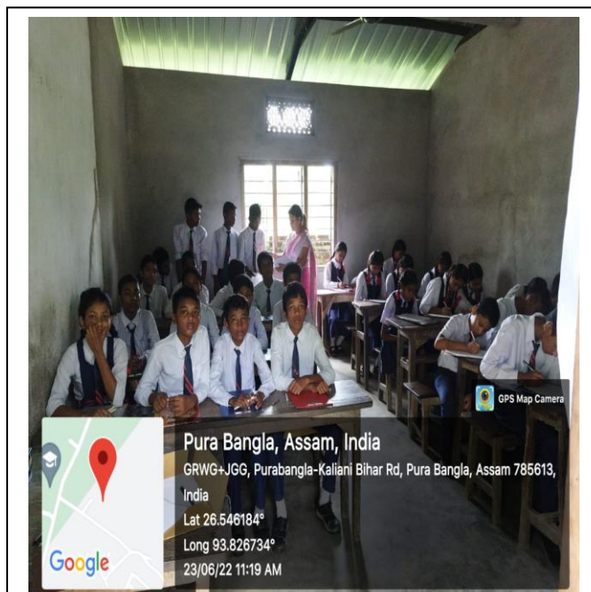
During MCQ question paper distribution.