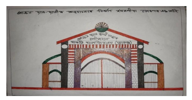
The Design of the College Gate

Maintaining good Alumni relations benefits the alumni as well as the institution. By helping the institution to become bigger, stronger and more successful institution, the Alumni are also enhancing the value of their own degree of qualification. By taking into consideration about this view, the Alumni Association had decided to set up the College Gate and hence organized the stone laid ceremony of the college Gate on 14<sup>th</sup> November 2019.