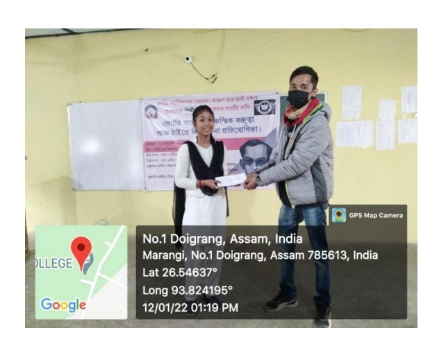
Some Pictures of the Pre-Celebration of Silpi Divas, 2022