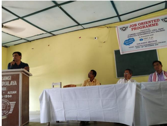
The list of participants of job oriented programme organized by career Counselling cell 28/09/2019